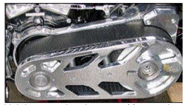
Lightly grease bearing race of front and rear bearings, for ease of installation, and slide support onto pulley covers.