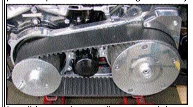
Install front and rear pulley covers. It is suggested that the bolts be loctited.

By supporting only the rear shaft, which is all that is really needed, we have eliminated any potential problems that mis-alignment may cause.