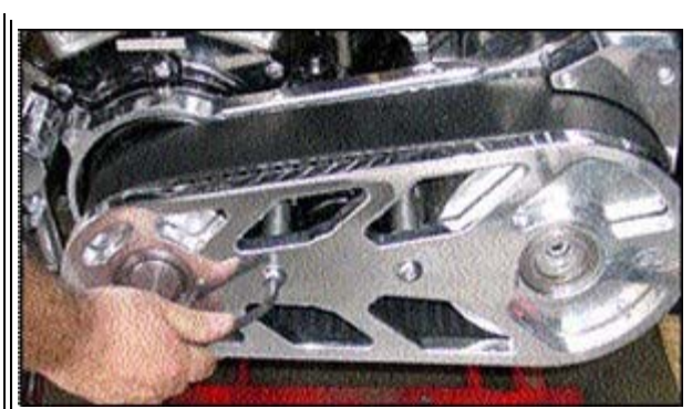
Install buttonhead bolts to secure support to the stand-offs.