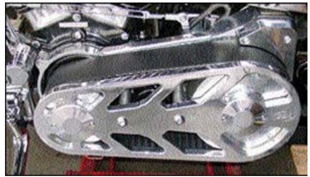
Install front and rear bearing covers.